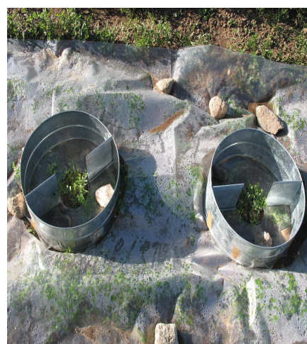
Figure 1. Splash cup used in the experiment